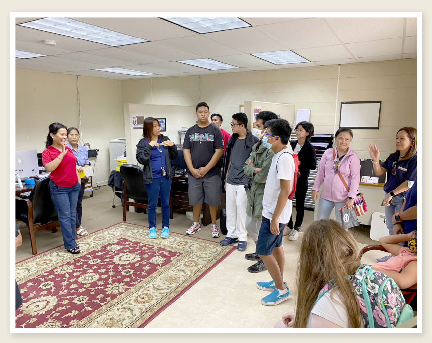
Northern Marianas College Campus visit

Marianas High Schools students with Individualized Education Program actively participated with their peers in post-secondary (higher education, employment) opportunities.