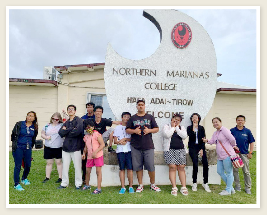
PSS Co-Op Spring 2023 Fair, Hyatt Regency