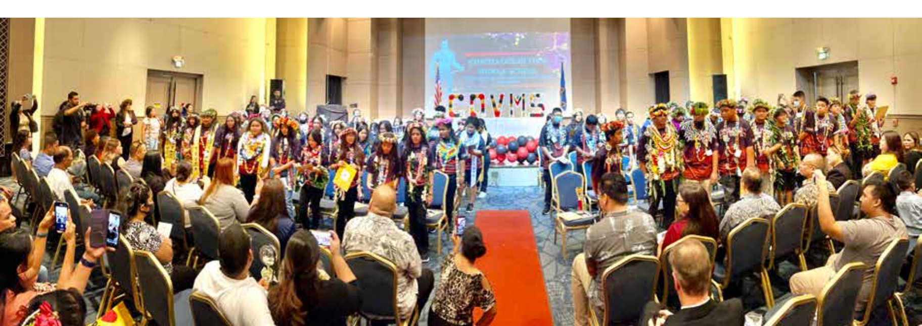
The 80 promoted Chacha Oceanview Middle School students perform to their families, friends and the community during the culmination of their promotion ceremony last Wednesday at Saipan World Resort.

"To my lolo and lola, you have been the foundation of our successes as a family. You have given you children the wisest of wisdoms to carry over us, to your grandchildren."