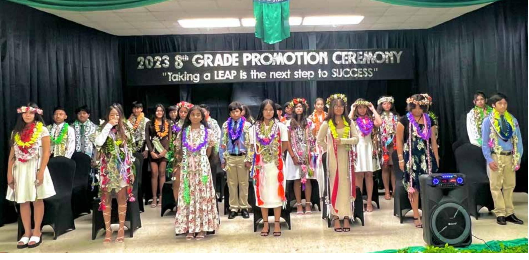
The 28 promoted students at Tinian Junior High School are introduced to the public.