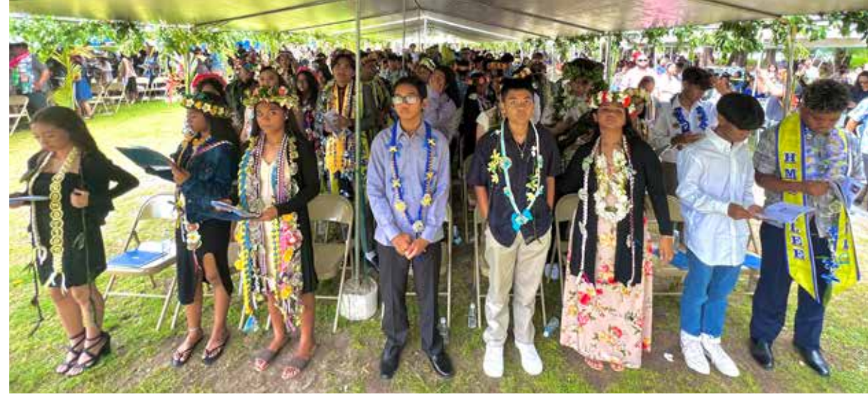
The 8th grade promotes of Hopwood perform their class song, "I Lived" by One Republic.