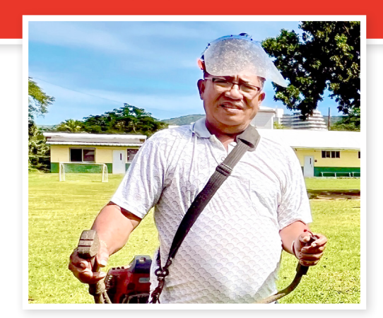
Trades and Maintenance of the Year Page 10