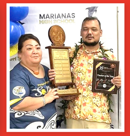
Teacher of the Year Page 2