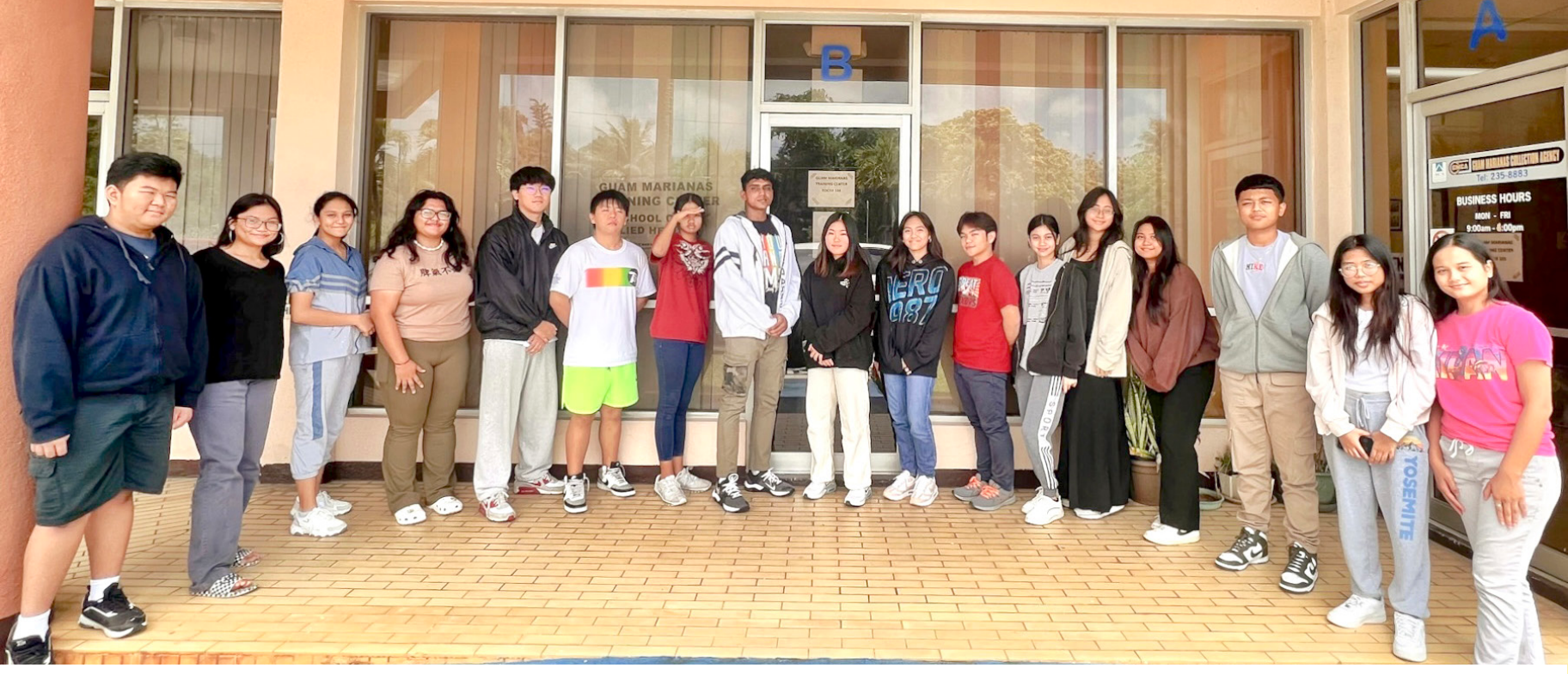
Seventeen of the 21 students-cohorts of the PSS-CTE Certified Nursing Assistantship Program.

The participants are junior high school, senior high school, incoming college freshmen, or current college students.