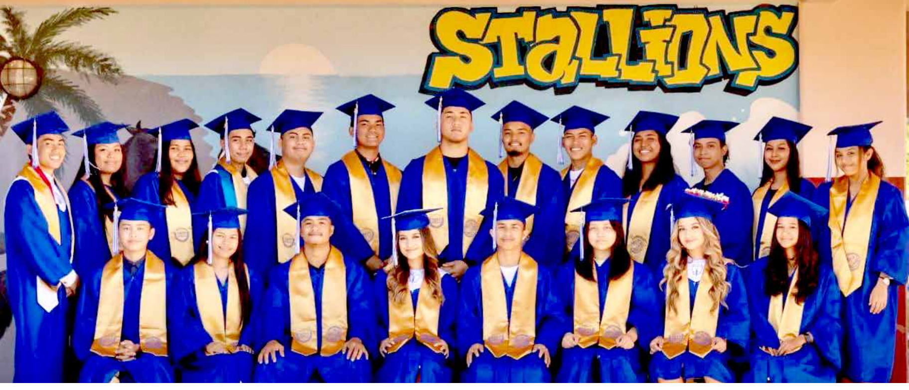
Tinian High School Graduationg Class of 2022.