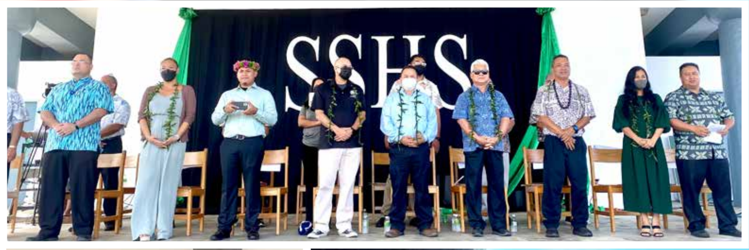
Education and local officials joined SSHS community in celebrating the milestone of the 154 graduates.