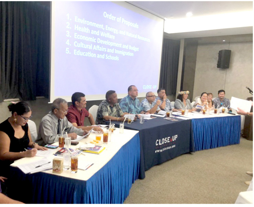
Members of the CNMI Legislature sit together as they listen to proposals made by the students.

ROM October 23-27, students from all over the CNMI came together to participate in the 2022 Close-Up Youth Summit at the Saipan World Resort. The Close Up Youth Summit is an opportunity for students to research local problems and brainstorm solutions affecting our community. They also got a close-up opportunity to meet and discuss their thoughts with professionals and lawmakers who work daily to battle the same issues