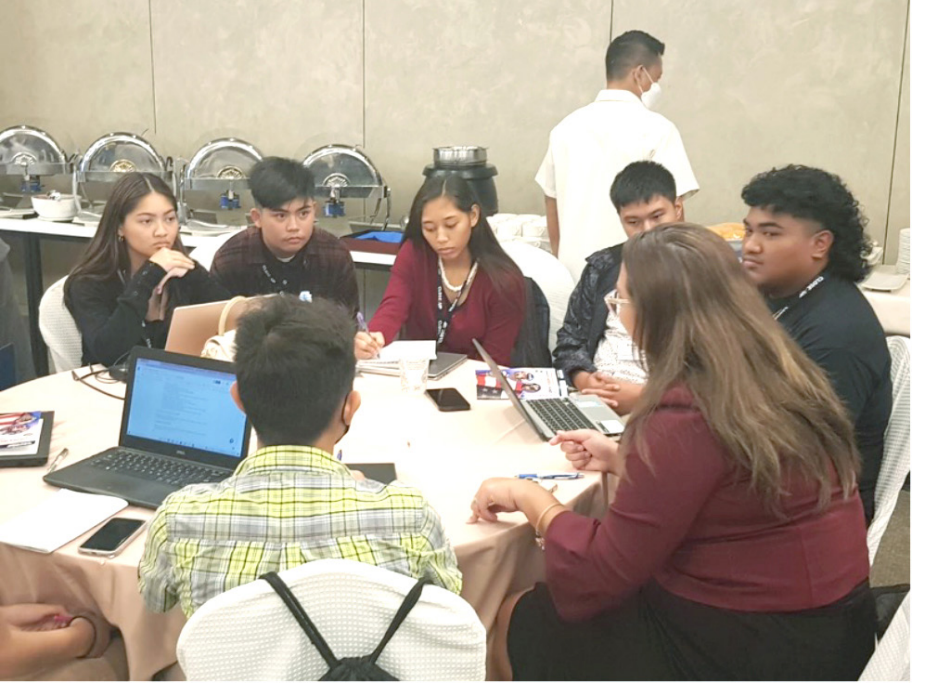
Students present their proposal to members of the CNMI Legislature.

they chose, and began writing their own proposals to address the problem. Instructors gave them guidance on how to write their drafts, and the students engaged in discussions over their chosen issue. They were also able to get insights from experts from different Departments and Organizations in drafting their proposals, as well as U.S. Congressman Kilili Sablan.