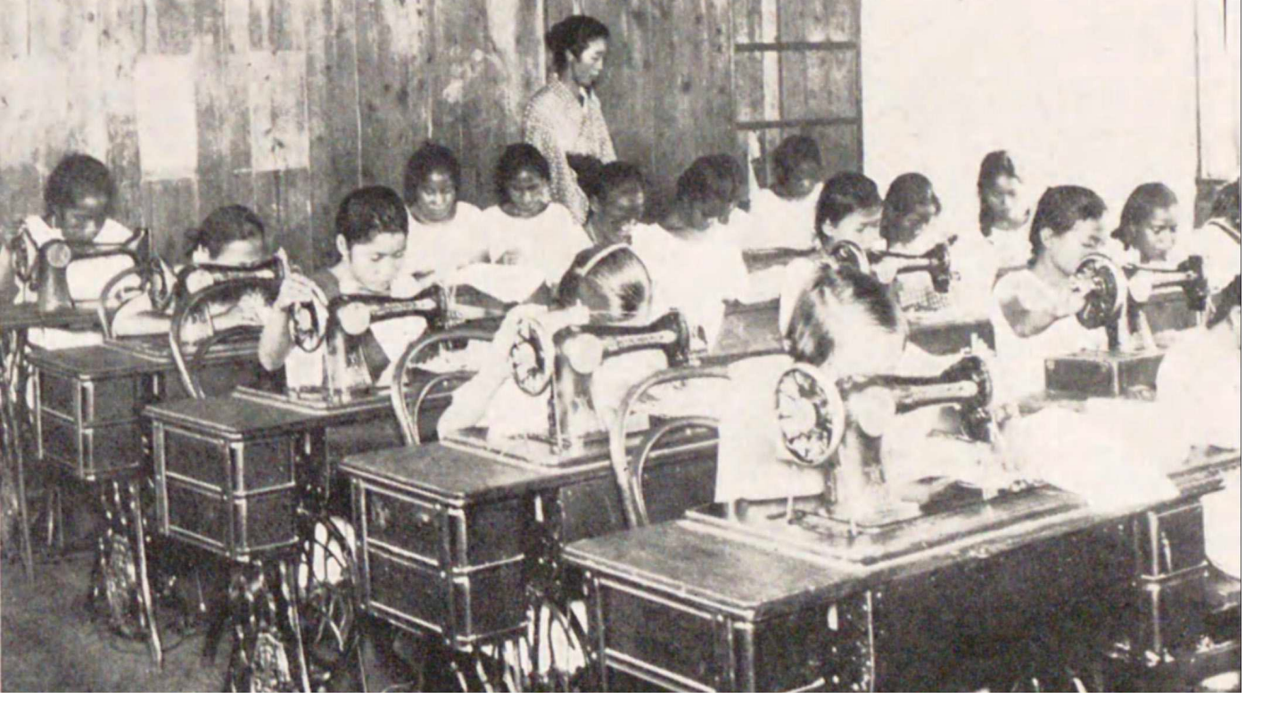
Sewing class in Saipan circa 1932.