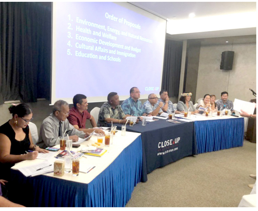
Members of the CNMI Legislature sit together as they listen to proposals made by the students.

ROM October 23-27, students from all over the CNMI came together to participate in the 2022 Close-Up Youth Summit at the Saipan World Resort. The Close Up Youth Summit is an opportunity for students to research local problems and brainstorm solutions affecting our community. They also got a close-up opportunity to meet and discuss their thoughts with professionals and lawmakers who work daily to battle the same issues.